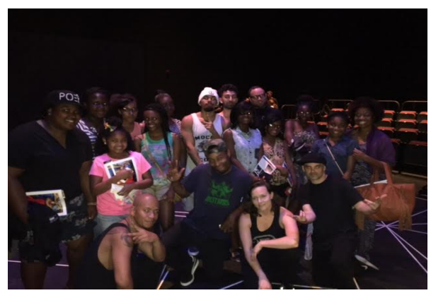
The GIRLZ with performers from "Opposing Forces" on stage.