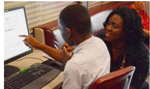
CPN CEO helps Sanders-Clyde 4th grader establish financial savings plan

May has been a busy month for our Neighborhood schools! Students participated in field trips to Blackbaud and Boeing, and the BB&T Banking Bus visited Mary Ford, Sanders-Clyde and other spots in the CPN Neighborhood. CPN partnered with Reading Partners to host a successful Family Literacy Night at Mary Ford, attended by 150+ residents, and students participating in our after school programs showcased their work at CPN's second "Show What You Know" series. A big shout out goes to our generous donors who supported CPN on May 3rd, Lowcountry Giving Day! They helped us raise $74,457, more than doubling our goal for the day! Summer might be around the corner, but we are still at full speed here at CPN. Follow us on our new Instagram account @CharlestonPromiseNeighborhood, and keep up with us in real-time on our new blog www.chspromiseblog.wordpress.com .