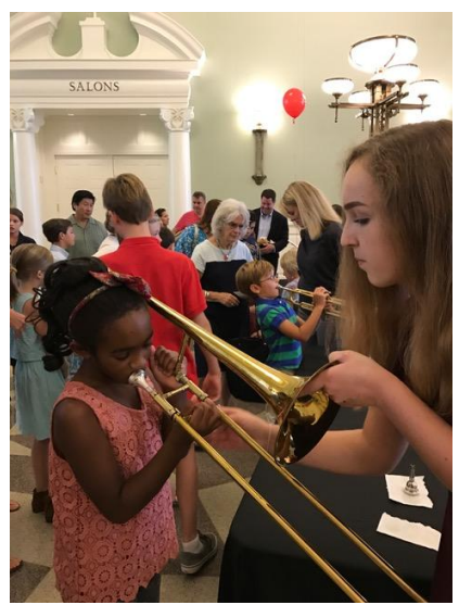
Students test instruments at the "petting zco" this past Saturday at the Gaillard Center.

Expanded Learning Time (ELT) launched right after Labor Day, co-sponsored by CPN and Charleston County School District's (CCSD) Office of Expanded Learning and Community Education, to offer 500 students robust afterschool programming at Chicora, Mary Ford and Sanders-Clyde schools. We received promising results from CCSD's data analysis of our 2015-16 ELT programs, that helps us hone our focus on academic remediation during the 2016-17 programming year. Finally, thanks to a generous gift from Blackbaud, 50 CPN students attended the September 24th Charleston Symphony Orchestra Cirque De La Symphonie Family Concert at the Gaillard Center. Before the performance, students participated in a "petting zoo" where they handled classical instruments under the guidance of